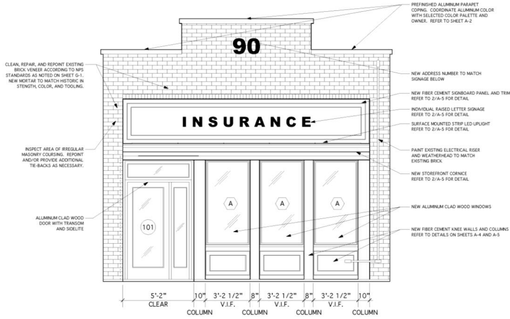
1 PROPOSED EAST ELEVATION Scale: 3/8" = 1'-0" GENERAL NOTE: COORDINATE COLOR SELECTION OF ALL NEW MATERIAL FINISHES WITH SELECTED COLOR PALETTE AND OWNER.